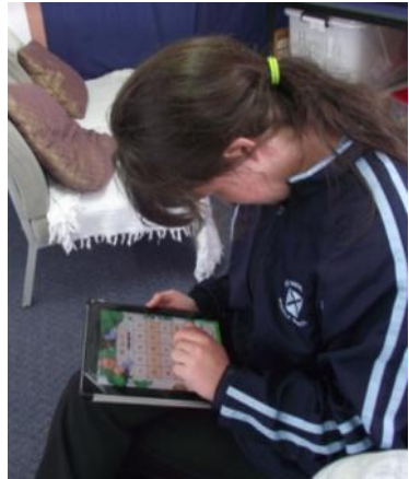
New iPads being put to great use.