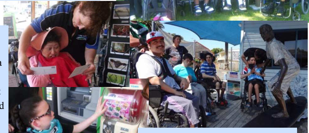
Exploring the township

This year we explored the Mount township hunting out statues and landmarks before a well earned ice-cream from Copenhagen Cones. We went on a barge trip which we shared with a Fonterra milk tanker,. The barge also picked up a tractor and a truck full of avocados. We walked around the base track of the Mount where we enjoyed the beautiful scenery and chatted to people along the way. The stunning weather and activities were enjoyed by all.