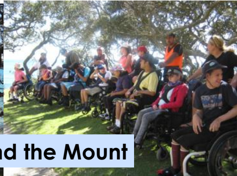
Let's go around the Mount