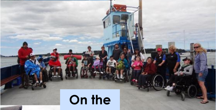
On the Barge