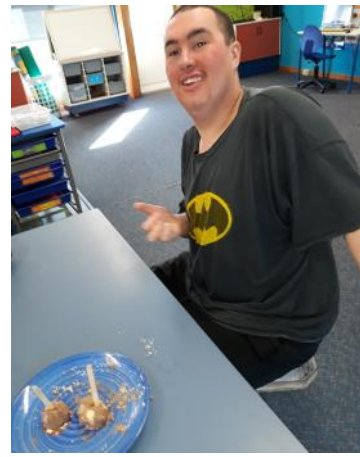
Popsicle sticks were used to make Popcakes.