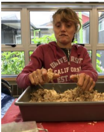
The students made lavender scented Potpourri bags using wood chips.