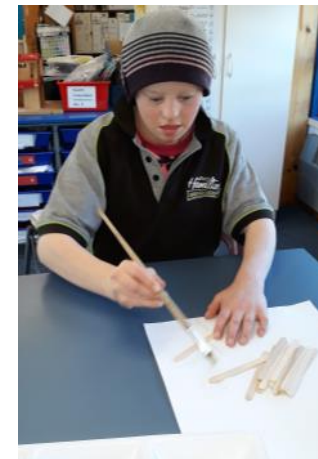
The students are gluing the popsicle sticks ready to put on their serviette holders.